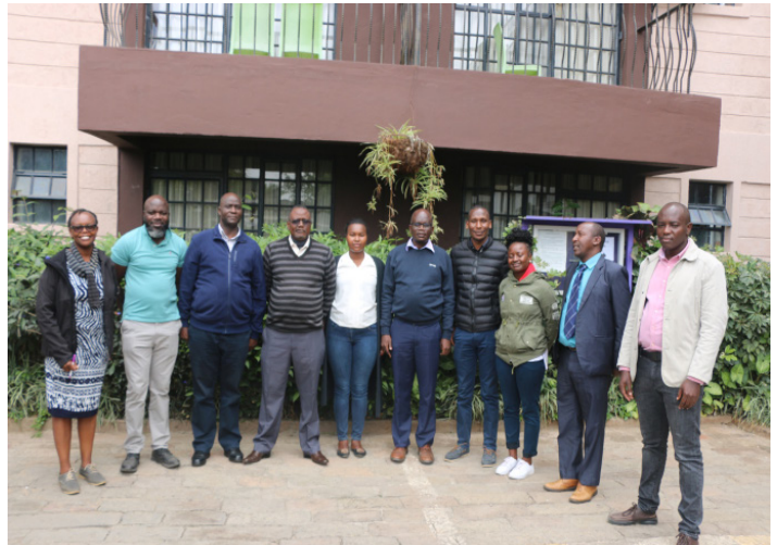
Participants posing for a photo during the drafting of the KSG manual

CCCF training manual developed in collaboration with Kenya School of Government. This will go a long way in ensuring that training and support is provided to both government officials and non-state actors interested in the CCCF mechanism on a sustainable basis.